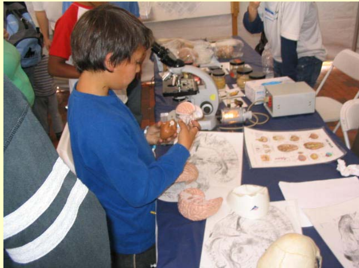
Brain in pieces Can you put it back together? (and name the parts)