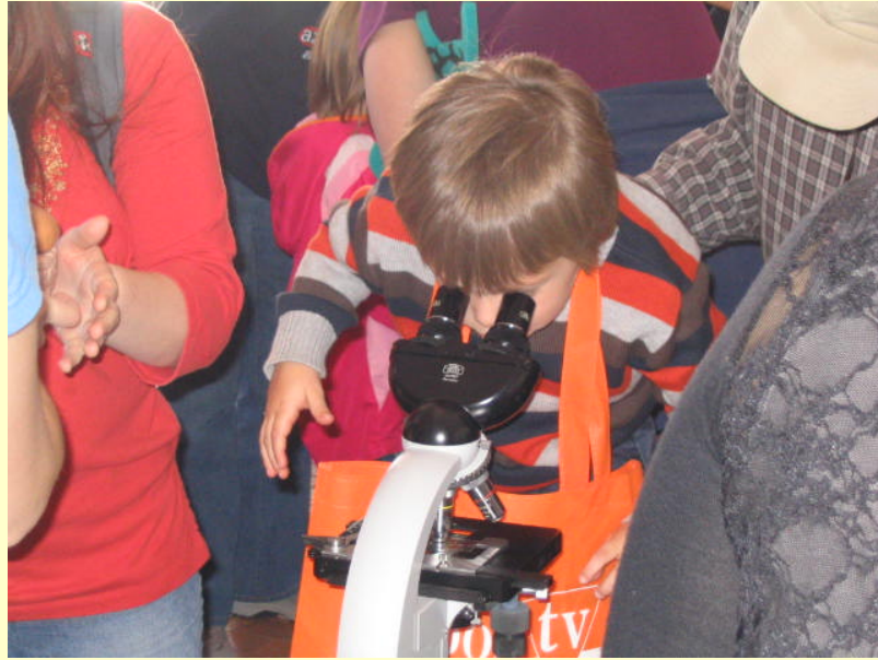
Wow...! Real neurons