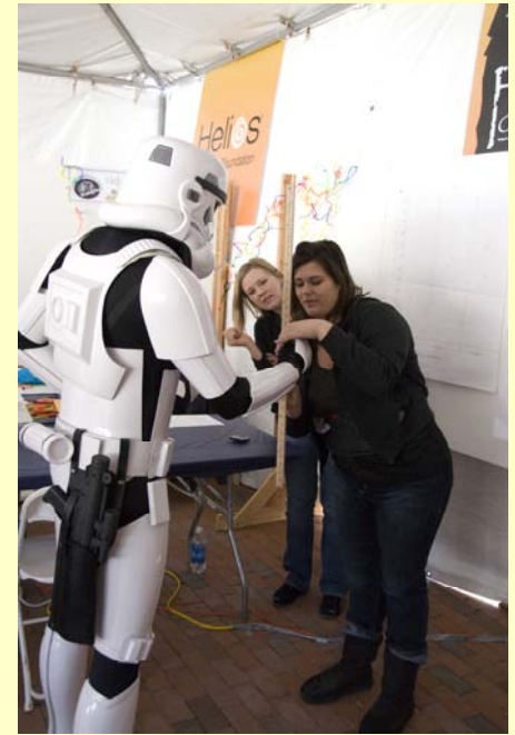
Hmmm... not bad given the armor!