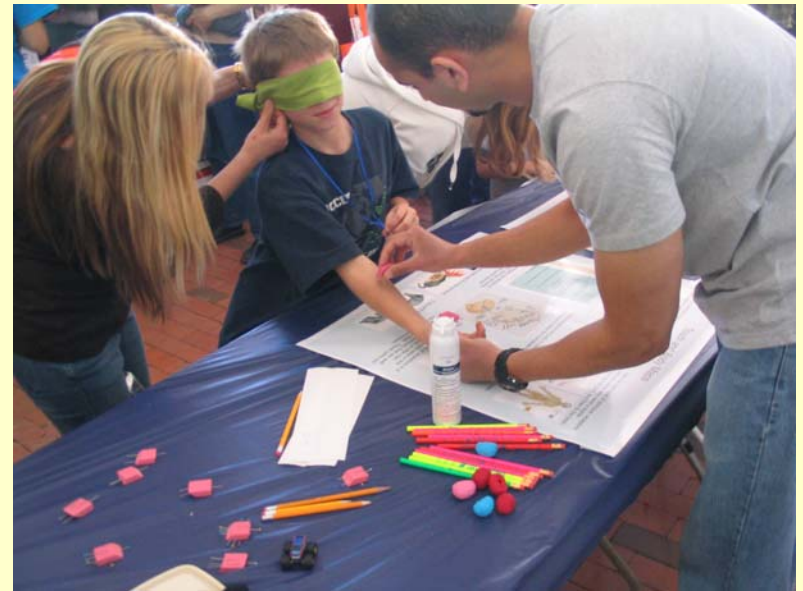
Concentrate! Do you feel one or two?