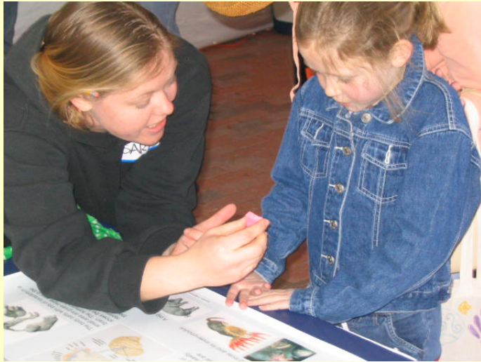
Two-points discrimination threshold