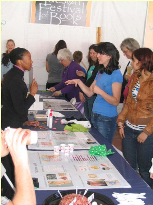
Speaking with our hands....