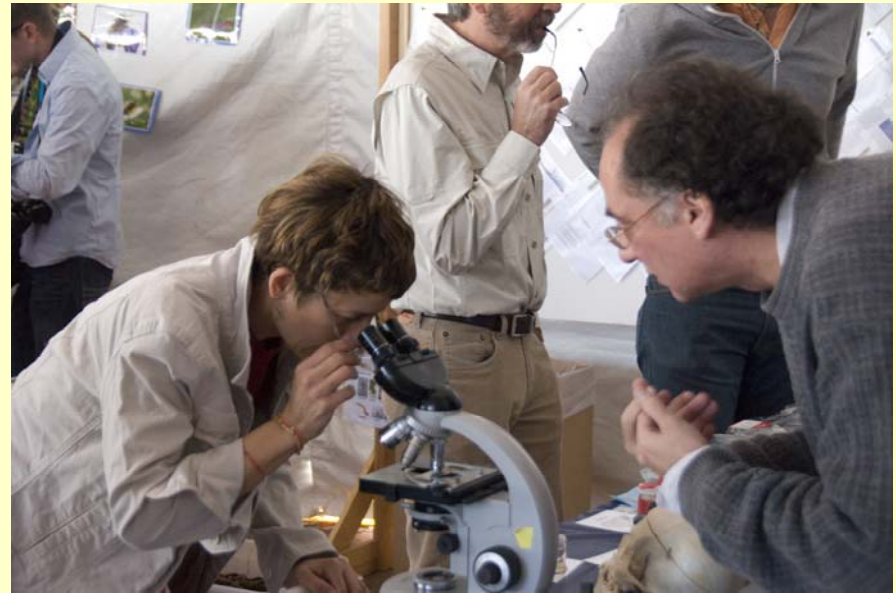
Hard to explain... you have to see for yourself!